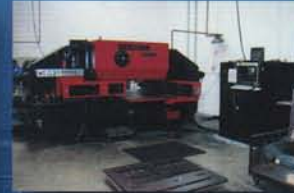
Prototype Rapid Prototyping