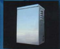
Production Local or Offshore

Give us a Call Today To See How We Can Help you (760) 630-1201