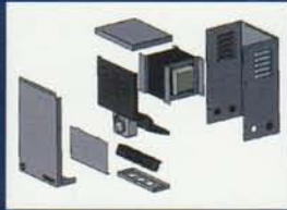
Design 3D CAD Design